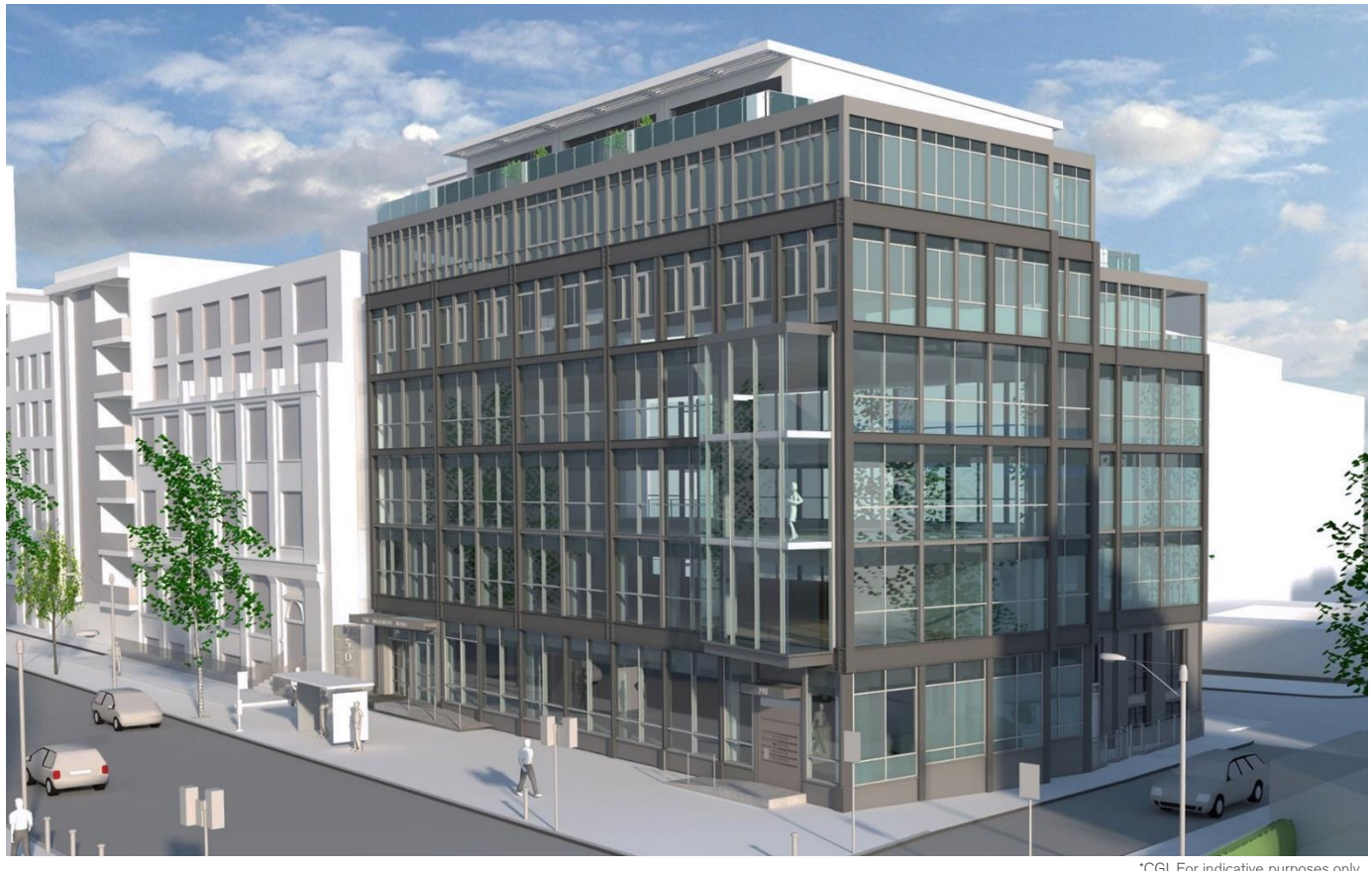
*CGI. For indicative purposes only