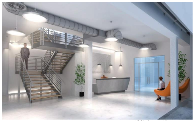
*CGI of ground floor reception