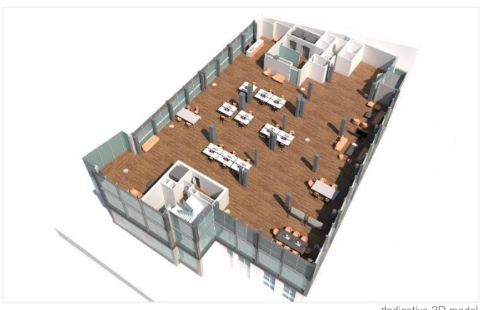
*Indicative 3D model