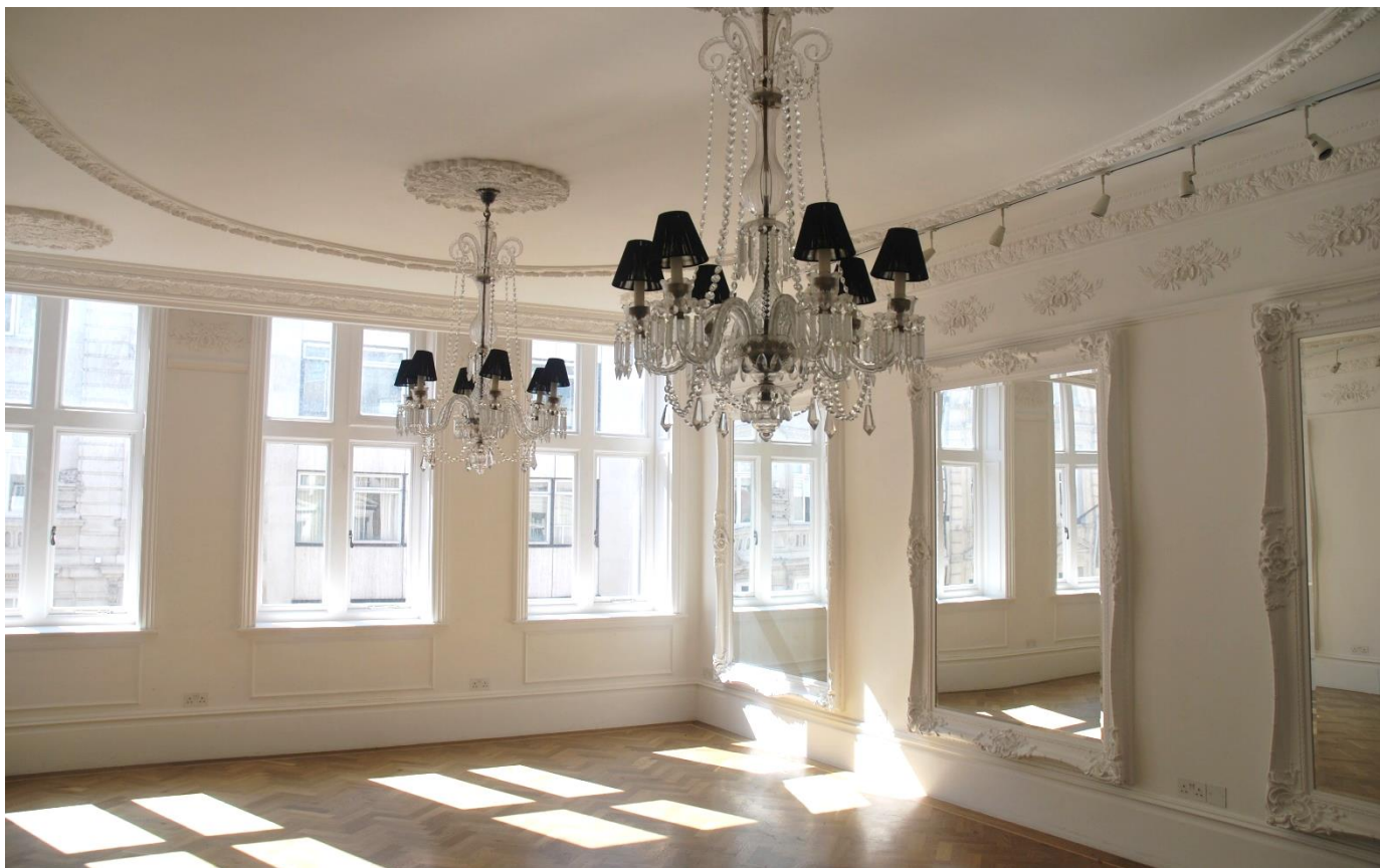
2nd floor photograph