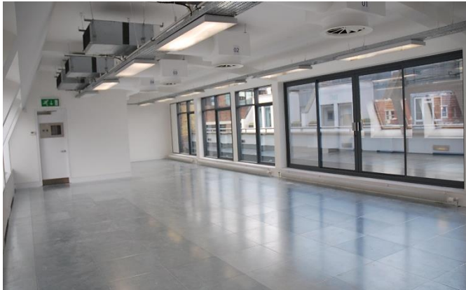
* Photograph taken prior to current tenants' fit out