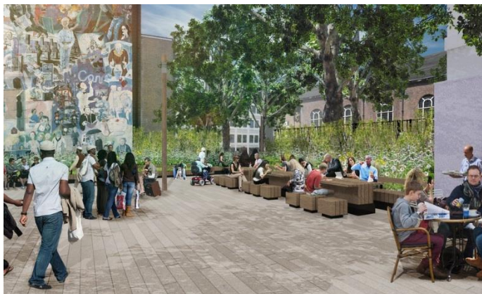
CGI for indicative purposes only