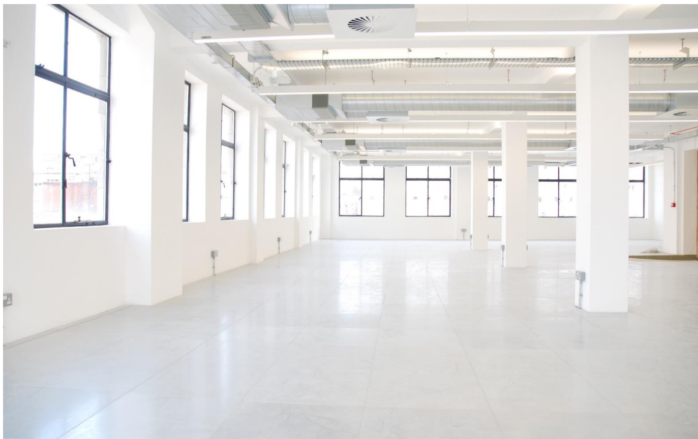
Refurbished 4th floor north