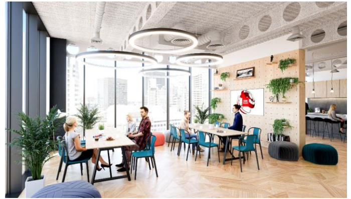
*Pictures are CGIs and for indicative purposes only