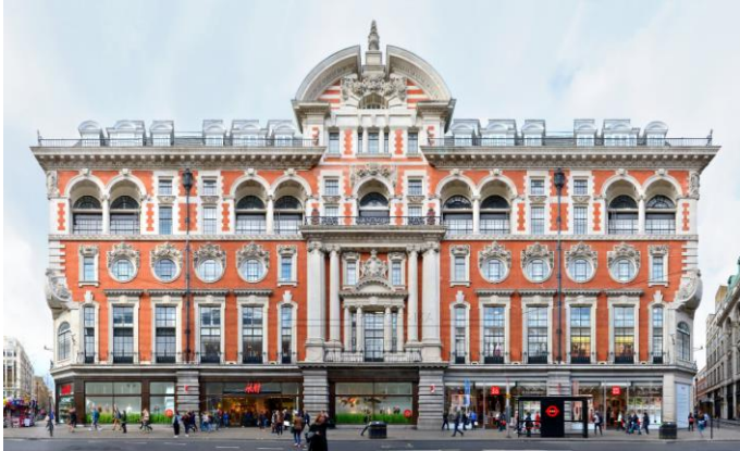
*Picture for indicative purposes on refurbishment options

TO BE REFURBISHED | AVAILABLE c. SEPTEMBER 2023 | 15,000 up to 29,436 sq ft | Part or Entire 2nd FLOOR