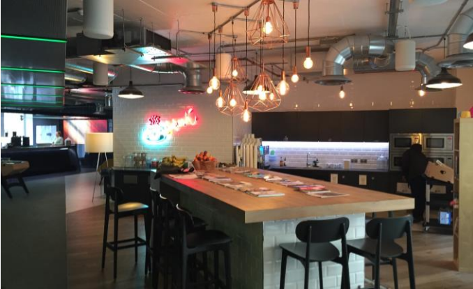
*All Pictures for indicative purposes of 2 nd & 3 rd floor (identical)

PART 4th FLOOR WITH TWO NEW TERRACES | 21,463 sq ft (plus option upon further 6,668 sq ft on remainder of floor, post refurbishment available circa Q2 2024)